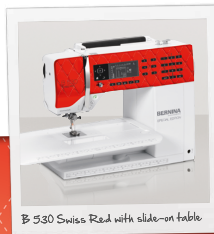
B 530 Swiss Red with slide-on table