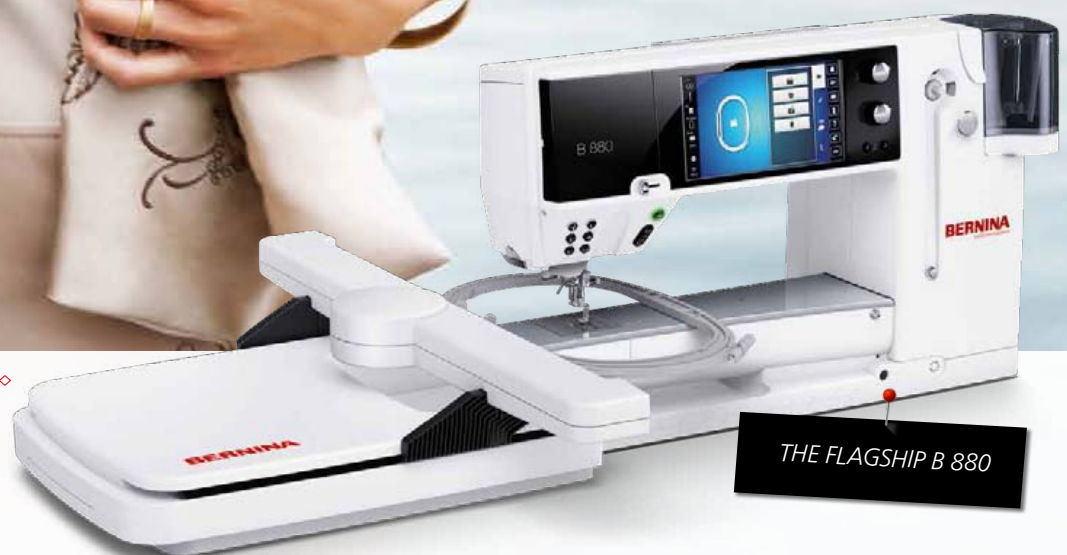
THE FLAGSHIP B 880

1 new shawl in time for our special dinner