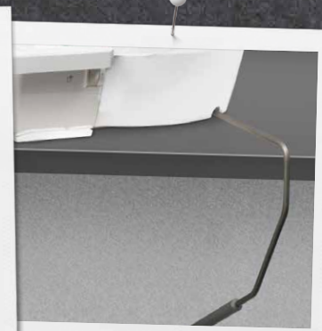
BERNINA Free-Hand System (FHS) for knee-operated presser-foot lift