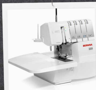
L 460 with slide-on table

The well-lit grand workspace of this overlocker eases sewing as well as threading of loopers and needles. Thanks to the Free-Hand System (FHS) that raises and lowers the presser foot both hands are free for sewing and placing the fabric. The slide-on table expands the work space to support larger sewing projects.