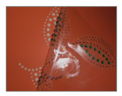
NOTE: For more detailed instructions on the use of the CrystalWorks designs and tools, see the information included on the Gramercy CD.