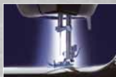
HALOGEN SEWING LIGHT