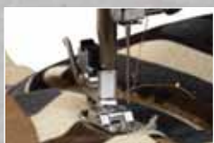
SNAP ON PRESSER FEET