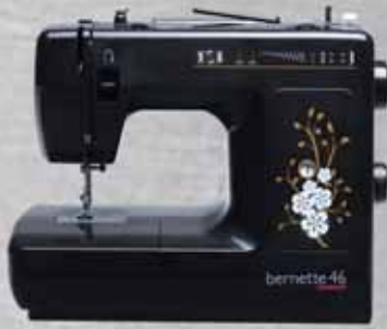
bernette 46 BERNINA +