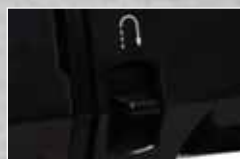
REVERSE SEWING BUTTON