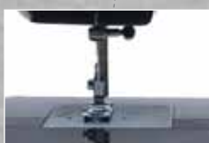
2 STEP PRESSER FOOT LIFTER