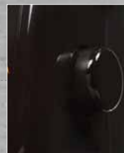
STITCH SELECTION KNOB