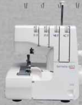
bernette 610D BERNINA +