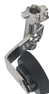
Roller Foot #55