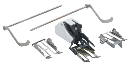
Walking Foot #50