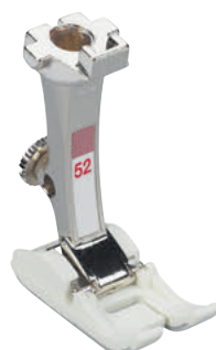
Straight Stitch Foot #52