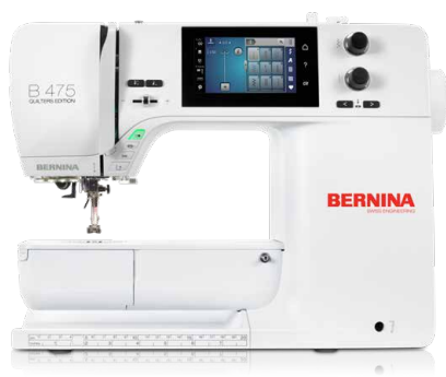
BERNINA 475 QE