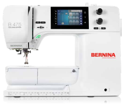
BERNINA 475 QE