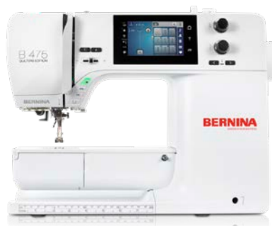
BERNINA 475 QE