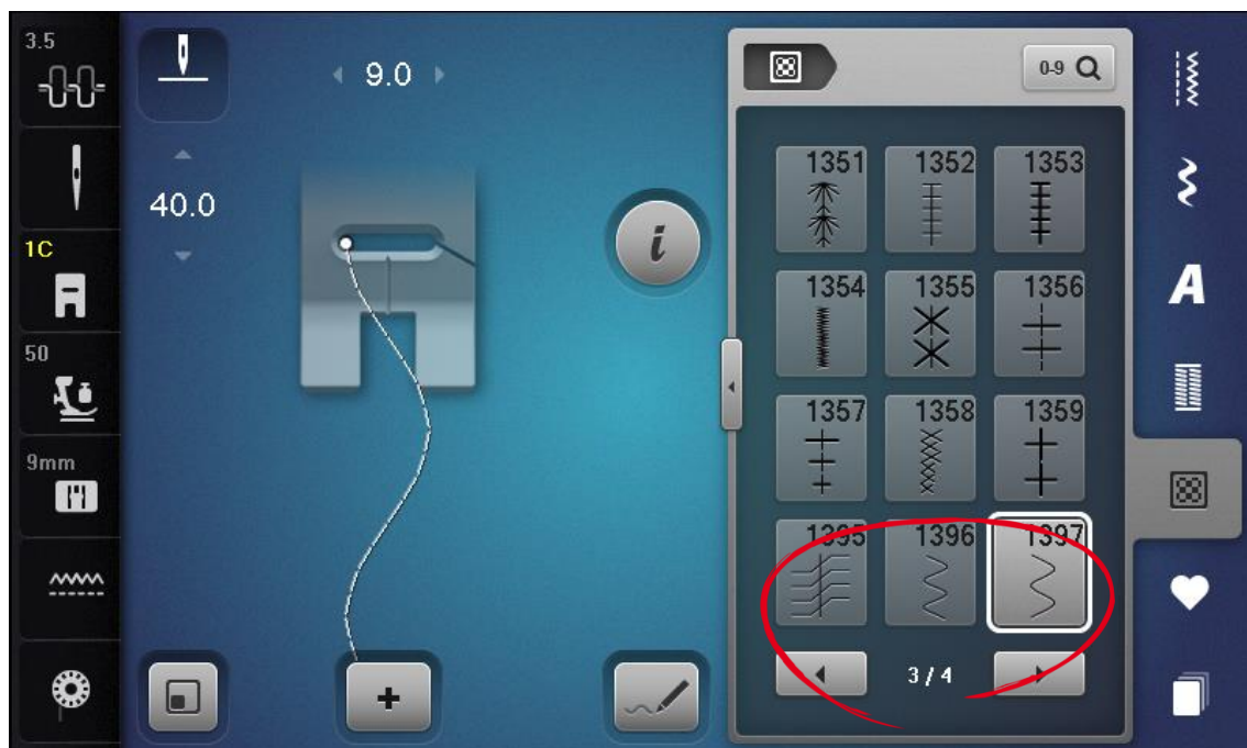
Example of B 790 user interface