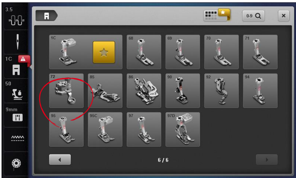
Example B 790 user interface. Foot selectable

The new optionally available presser foot ‘Adjustable Ruler foot #72’ is now displayed when recommended (B 720 / 740 / 770QE) and can be selected (only B 790). Due to the height-adjustable presser foot you can quilt free-motion or along a ruler. Via the height adjustment, the height of the presser foot sole can be adjusted optimally corresponding with the fabric thickness.