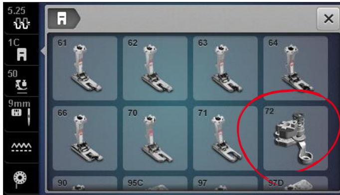
Example B 770 QE / 740 / 720 user interface. Foot recommendation