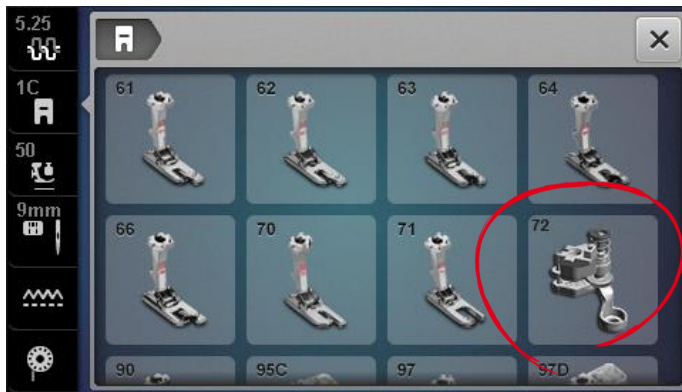
Example B 770 QE / 740 / 720 user interface. Foot recommendation