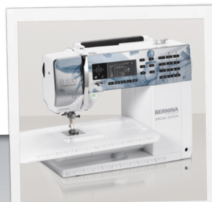
B 530 Dressmaker with slide-on table