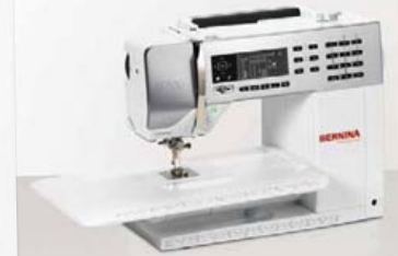
B 530 with slide-on table

The B 530 and B 550QE were designed with your sewing future in mind. A variety of special accessories and presser feet are included with the machine. When you are ready to expand your options, you'll find a broad range of accessories available. Whatever new techniques you want to explore, you'll find the right accessories to take your sewing and quilting to the next level.