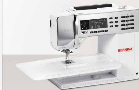
B 530 with slide-on table

The BERNINA 570 QE and 530 models immediately impress with their simple, classic design. BERNINA believes elegant form should be combined with superior function to set new design standards. Whether you're sewing or quilting, modern aesthetics plus cutting-edge technology are integral to the B 570 QE and B 530.