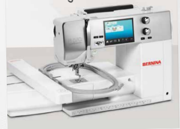
B 570 QE with optional embroidery module

The B 570 QE is a genuine all-rounder that can sew, quilt and embroider. The touchscreen makes changing from sewing to embroidery mode a breeze. There are 50 stock embroidery designs to choose from, and you can upload your own embroidery designs via a USB connection. The designs can be edited right on the touchscreen with the Rotate, Mirror, Rescale, and Colour Change functions.