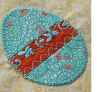
#107 and #719