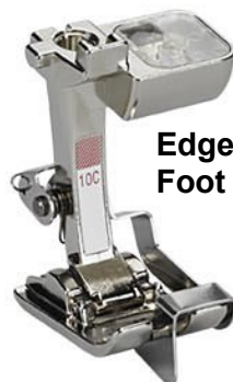
Edgestitch Foot #10C

Edgestitch Foot #10 is available as #10C, designed to work with the feed dog of rotary hook models that stitch 9mm wide stitches. It There is also a #10D, designed to work with the Dual Feed feature of the BERNINA 8 Series models.