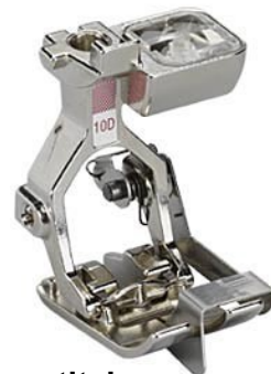
Edgestitch Foot #10D