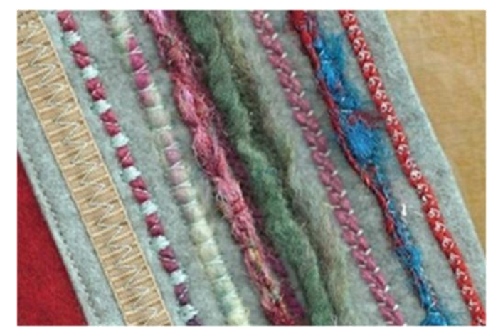
Spend some time experimenting and trying out various combinations to see which couching combinations work for your project.

Use invisible thread and a blindstitch to make the cord appear to be floating on the surface of the fabric.