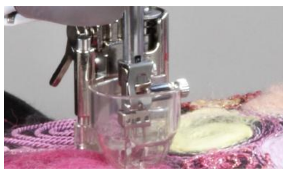
Rotary Hook Needle Punch