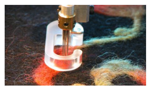
CB Hook Needle Punch