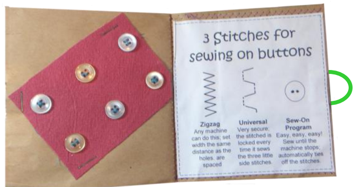
Pages 6 and 7

Inside Back Cover—Page 7: Print the stitch information from previous page on fabric or paper. Staple, glue or stitch it to page 7. Note: See the back cover information below before working on page 7.