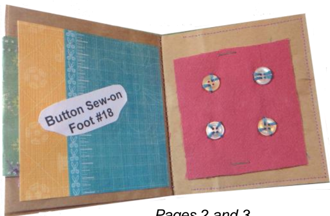
Pages 2 and 3

Page 3: Trim the swatch of fabric that has several buttons sewn to it over the edges of the buttons to fit on the page. Staple, glue or stitch it to secure.