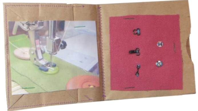
Pages 4 and 5

Page 6: Trim the swatch of fabric that has several buttons attached, secured by stitching an arrow, square, or “X” in the center so that it fits on the page. Staple, glue or stitch it to secure.