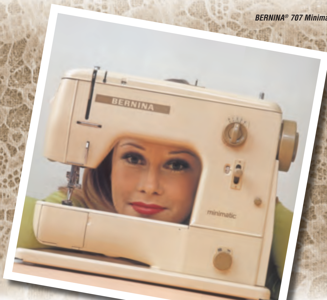
BERNINA® 707 Minimatic (1967-1972)

Visit www.berninausa.com for additional projects and product information.