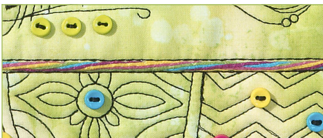
Embellish your wall art with colorful buttons and couched cords.

Tip: Position the buttons, arranging and rearranging them as desired, then take a digital photo to use as a placement guide.