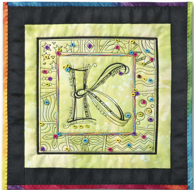
Finished size: 12½" x 12½"

Visit www.bernina.com for additional projects and information.