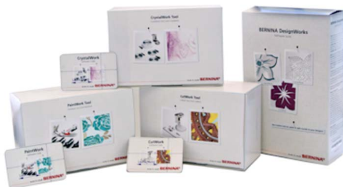
BERNINA DesignWorks Suite