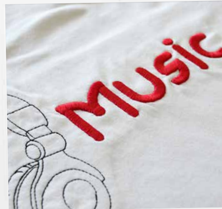
Puffy Lettering adds outstanding 3D effects to your embroidered letters.

The incredible software features are easy to use and navigate thanks to the updated user-friendly interface. The Positioning feature makes it easy to place designs in the right spot. Creating large designs is a cinch because of the Multi-hooping feature which automatically places more than one hoop for large designs. Palette positions are numbered for easy reference within the new Color Management system. And embroidering on quilts just got easier with the new Automated Quilt block layout feature. Whatever you imagine-you can do with the BERNINA Embroidery Software 8 DesignerPlus. Whether it's applying special effects to artwork, adding text, shapes, freehand drawing elements or tracing bitmaps for unique multi-media projects. Easily turn artwork from various graphic formats into embroidery designs in just one click using the Automatic Digitizing tool. Preview your design on different article options. Embroidery has never been easier and more fun.