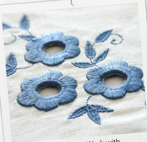
Advanced CutWork with Eyelet Embroidery and Appliqué