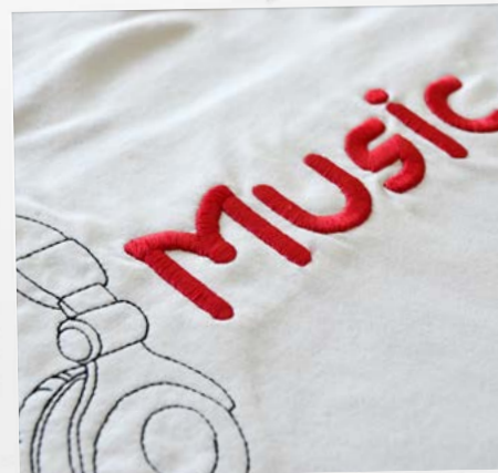
Puffy Lettering adds outstanding 3D effects to your embroidered letters.

The incredible software features are easy to use and navigate thanks to the updated user-friendly interface. The Positioning feature makes it easy to place designs in the right spot. Creating large designs is a cinch because of the Multi-hooping feature which automatically places more than one hoop for large designs. Palette positions are numbered for easy reference within the Color Management system. And embroidering on quilts just got easier with the Automated Quilt block layout feature. Whatever you imagine-you can do with the BERNINA Embroidery Software 8.1 DesignerPlus. Whether it's applying special effects to artwork, adding text, shapes, freehand drawing elements or tracing bitmaps for unique multi-media projects. Easily turn artwork from various graphic formats into embroidery designs in just one click using the Automatic Digitizing tool. Preview your design on different article options. Embroidery has never been easier and more fun.